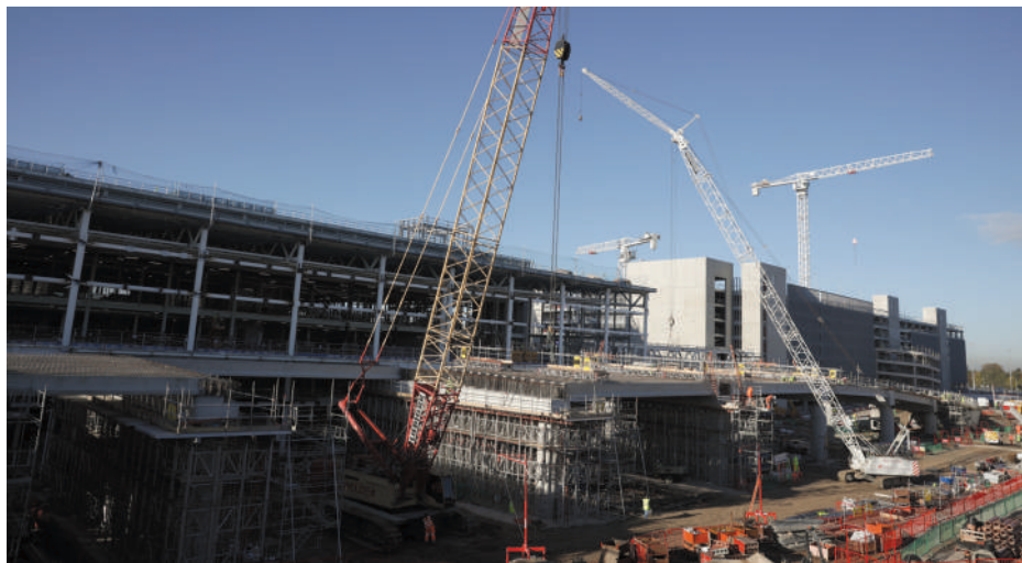
NEW TERMINAL WORK TAKES OFF Northwest England hub is meant to improve passenger experiences.

M anchester Airport in northwest England has begun the second phase of its $1.6-billion program with construction of a new 12-gate pier for Terminal 2 by London-based lead contractor Mace Group Ltd. Set for completion in 2025, the new pier will accommodate a variety of aircraft types. Other elements include a second security hall, expanded departure lounge and airfield reconfigurations. Mace will apply a variety of construction techniques to reduce embodied carbon emissions by up to 40%, such as precast concrete, prefabricated building components and an innovative piling design that minimizes excavation, according to the airport. New facilities will include nearly 30 shops, bars and restaurants. ■