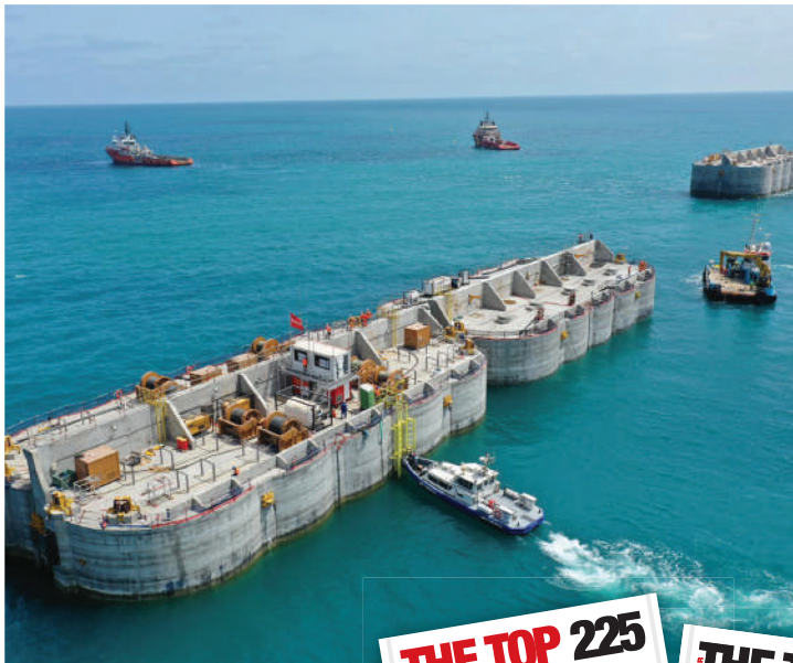
FLOATING Eiffage is part of the consortium working on the floating LNG terminal portion of the Greater Tortue Ahmeyim project off the West African coast.

“Rising temperatures threaten essential materials such as concrete and steel during transit, prompting an urgent need for innovative solutions,” he points out. “Embracing the call to ‘build back better,’ the