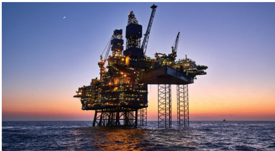
DECARBONIZING Scotland aims for floating wind power projects to reduce emissions at offshore oil and gas platforms.

U.K.'s Mott MacDonald and Korean engineer-contractor KEPCO have agreed to explore building large-scale nuclear projects in the U.K. using Korean technology. This follows South Korea's plan to invest $26 billion in U.K. energy and infrastructure projects.