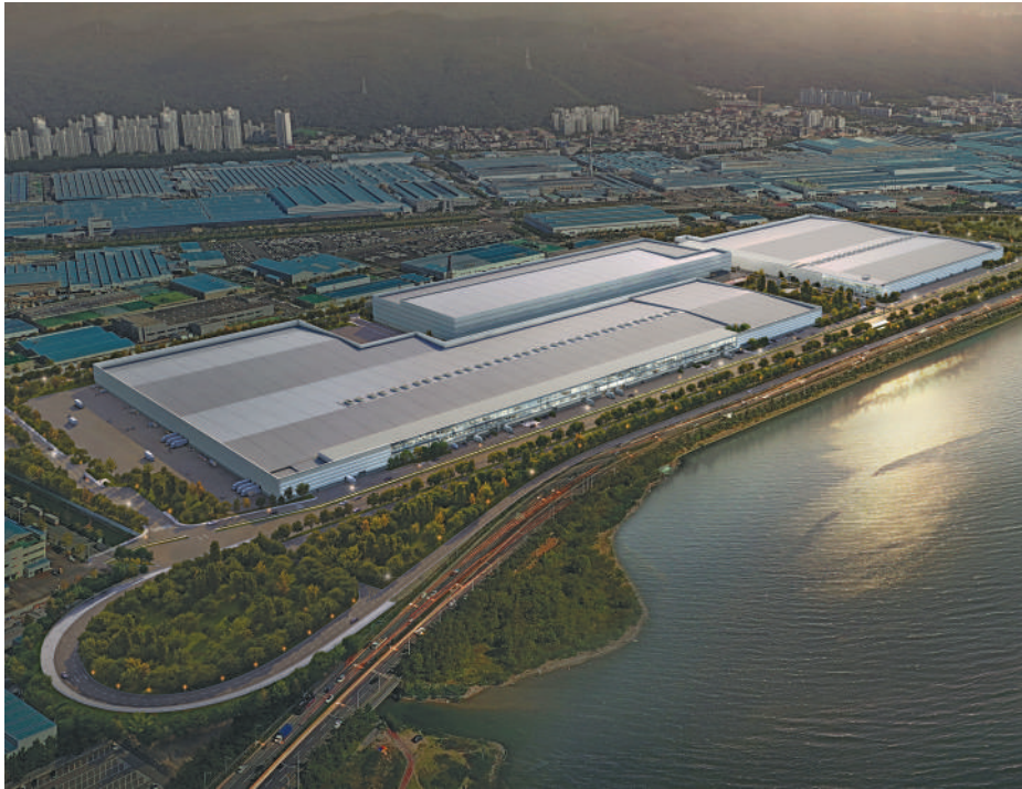
BIG COMPLEX Hyundai has five plants at its South Korea production site, but a new one would be the first making EVs.