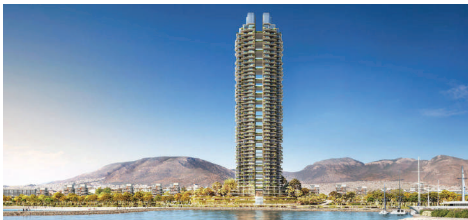
RECORD BREAKER When completed in 2026, the 650-ft-high Riviera Tower will be the tallest building in Greece.