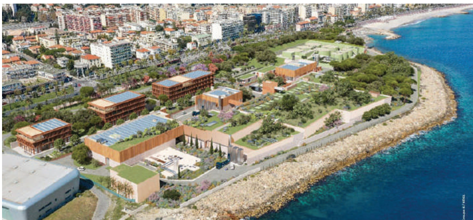
WATER CYCLE New plant will generate four times more energy than currently consumed, says the engineering team.